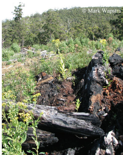
Plate 1. Senecio velleioides growing in a clearfelled and burnt forestry coupe near Dover

disturbance event. This means that going back to see if the species is still at a particular locality indicated by a database is a bit meaningless. The map presented in Figure 2 is likely to change as this “geographically transient” species shifts itself around the landscape, its windblown seed taking advantage of gaps in the forest canopy.