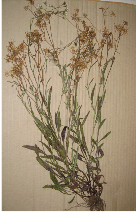
Plate 1. Specimen of Senecio psilocarpus from Dukes Marshes – note the multi-stemmed growth habit from the base of the plant

Lorilee Yeates provided useful commentary on an earlier version of the manuscript.